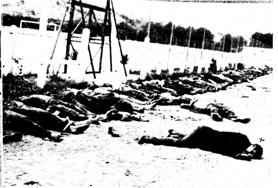
The young Algerian (x) on left in first picture is seen lying dead in the opposite picture.