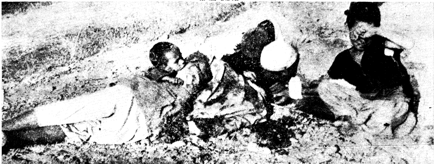
The children of a farmer weep over the body of their father murdered by Foreign Legionnaires.

These photos are reproduced from the "Black Paper on the French Repression", published and circulated by the MNA representatives in the U.S.A.